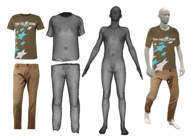
Figure 2. Given regular online retail store images, our method can automatically produce textures for pre-defined garment templates, that can be used to virtually dress SMPL [42] in 3D.