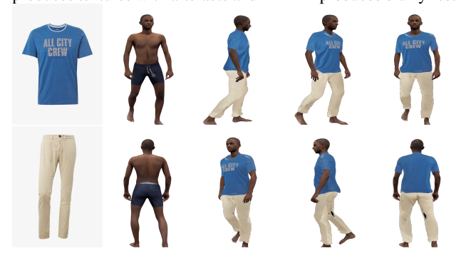
Figure 6. Photo-realistic virtual try-on. Given the garment images and a 3D avatar with texture, we show our automatically textured garments on top.

mapping with a neural model (Pix2Surf). While the optimization method takes up ten minutes to converge, Pix2Surf runs in real time, which is crucial for many applications such as virtual try-on. Our key idea is to learn the correspondence map from image pixels to a 2D UV parameterization of the surface, based on silhouette shape alone instead of texture , which makes the model invariant to the highly varying textures of clothing and consequently generalize better. We show Pix2Surf performs significantly better than classical approaches such as 2D TPS warping (while being orders of magnitude faster), and direct image-to-image translation approaches.