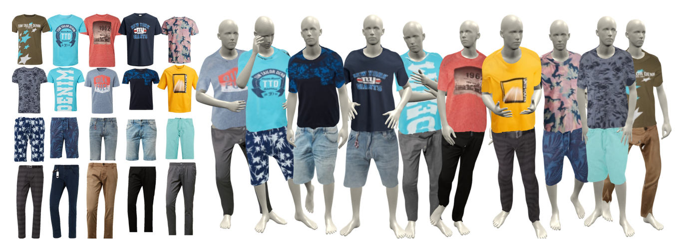
Figure 1: Our model Pix2Surf allows to digitally map the texture of online retail store clothing images to the 3D surface of virtual garment items enabling 3D virtual try-on in real-time.

{amir,gpons}@mpi-inf.mpg.de alldieck@cg.cs.tu-bs.de