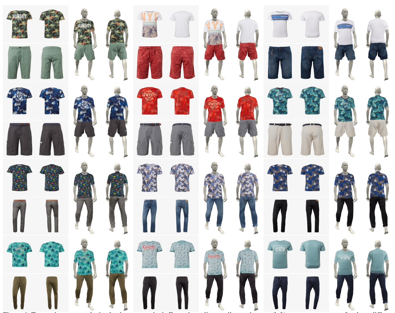
Figure 4. Textured garments obtained using our method: From the online retail store images (left), we create textures for three different garment categories (T-shirt, pants, shorts). We use the textured garments to virtually dress SMPL (right).

of all comparisons, the avatar textured with Pix2Surf was preferred over the one textured using the baselines.