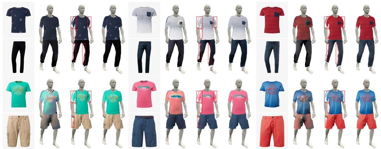
Figure 5. We compare our results against textures obtained via SC matching and an image-to-image translation baseline. SC matching produces textures with artefacts and Pix2Pix produces blurry results. Left: Pix2Pix, Middle: SC matching, Right: Pix2Surf